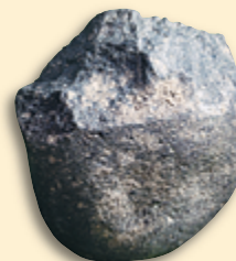
An early Stone Age chopper