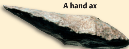
A hand ax