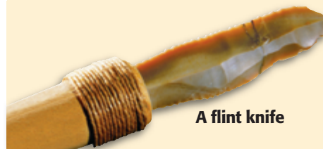
A flint knife